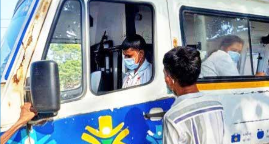
below) 1 8